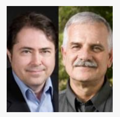
Faculty edit a special issue on "Visualizing User Experience and Stories: From Customer Journeys to Patient Experience Mapping" (edited by: Andre Kushniruk and Avi Parush ) https://www.kmel-journal.org/ojs/index.php/onlinepublication/issue/view/48